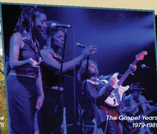
The Gospel Years 1979-1981