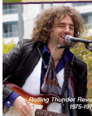
Rolling Thunder Revue 1975-1976

All songs written by Bob Dylan © Special Rider Music