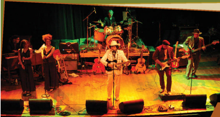
Highway 61 Revisited at the House of Blues, Los Angeles, 2006